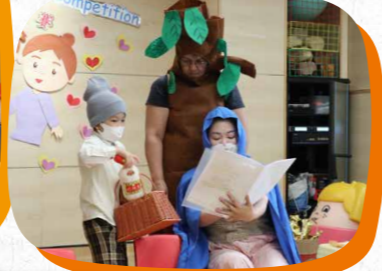
親子說故事比賽 Parent-Child Story Telling Competition