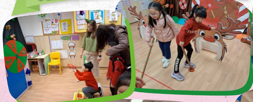
親子聖誕嘉年華 Parent-Child Christmas Carnival