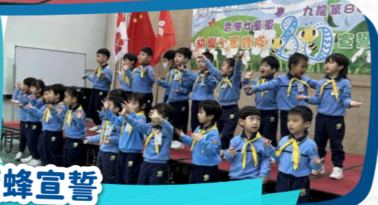
小蜜蜂宣誓 Happy Bee Oath Ceremony